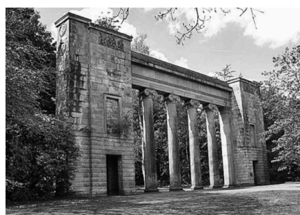
The view from Tom's front door in 1867: Manchester's original Town Hall / All that remains Manchester's original Town Hall.

The location then was of the highest local significance as the site faced the city's original Town Hall on the corner of King Street. Manchester had become a place to do business in.